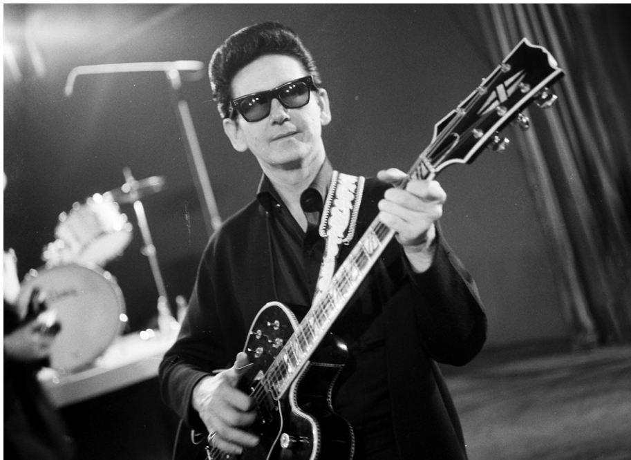
Roy Orbison in 1965.